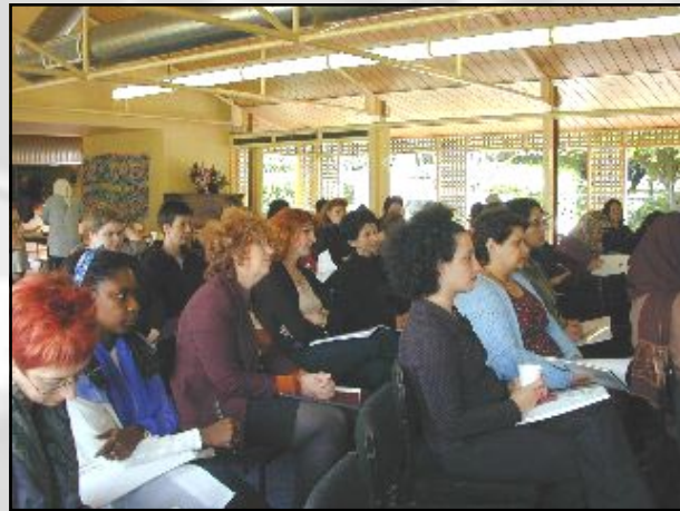
AGM 2001 Edinburgh Gardens