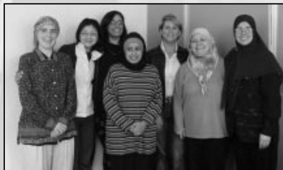
Committee of Management 2002