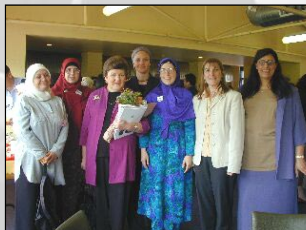
AGM 2001 Edinburgh Gardens